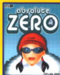
MiniFizz (Girls only)